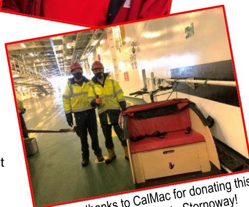
Sincere thanks to CalMac for donating this Trishaw's ride across to Stornoway!