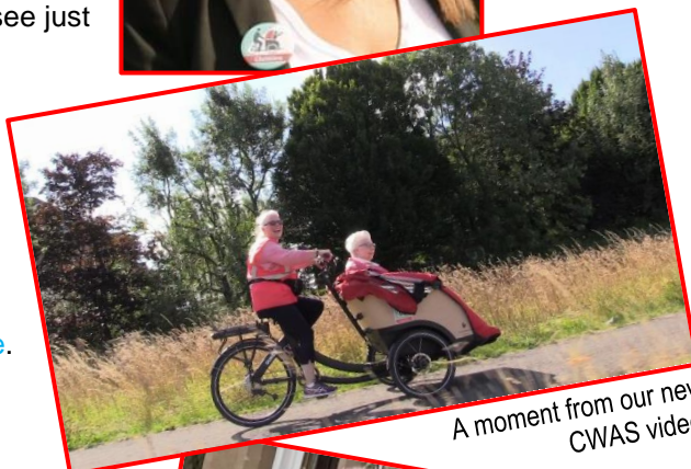
A moment from our new CWAS video.