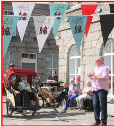
"Meldrum Meg" was hugely enjoyed by a carer and resident of West Bank House care home.