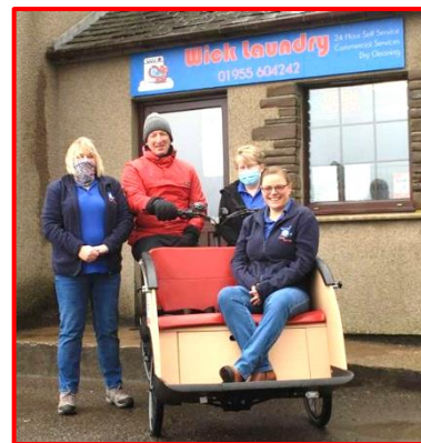
Wick Chapter spreading Christmas cheer: just part of its service to the community that prompted a generous donation from local business Wick Laundry.